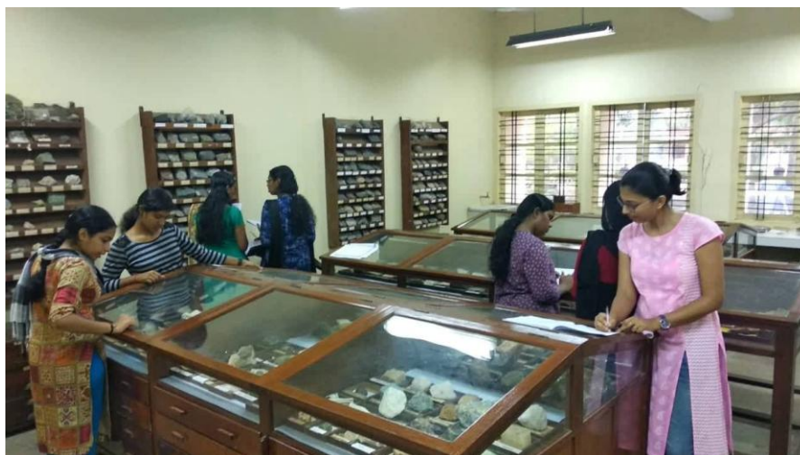
Photograph showing the students visiting Geology museum