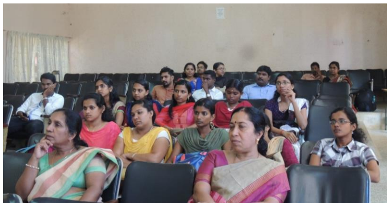
The participants in the Dept. Level Induction Programme-2016