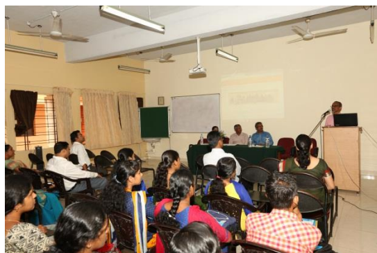
A view of the audience