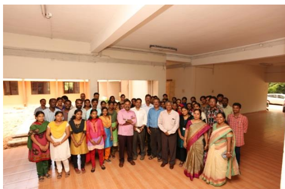
Another view of the audience