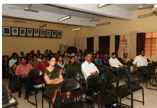
Staff and students of School of Earth System