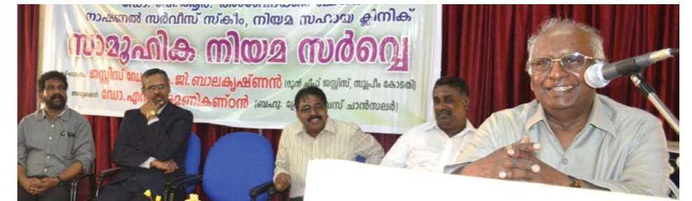
FORMER CHIEF JUSTICE SHRI. K.G. BALAKRISHNAN SPEAKING AT THE INAUGURAL FUNCTION