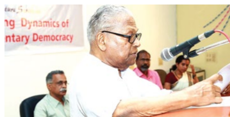
OPPOSITION LEADER V.S. ACHUTHANANDAN SPEAKING AT THE V. K. SUKUMARAN NAIR CHAIR FOR PARLIAMENTARY AFFAIRS OF THE DEPARTMENT OF POLITICAL SCIENCE

The V. K. Sukumaran Nair Chair for Parliamentary Affairs of the Department of Political Science has organised a lecture series on "Changing dynamics of Parliamentary democracy." Opposition leader V.S. Achuthanandan inaugurated the programme. Renowned scholars and political practitioners delivered lectures.