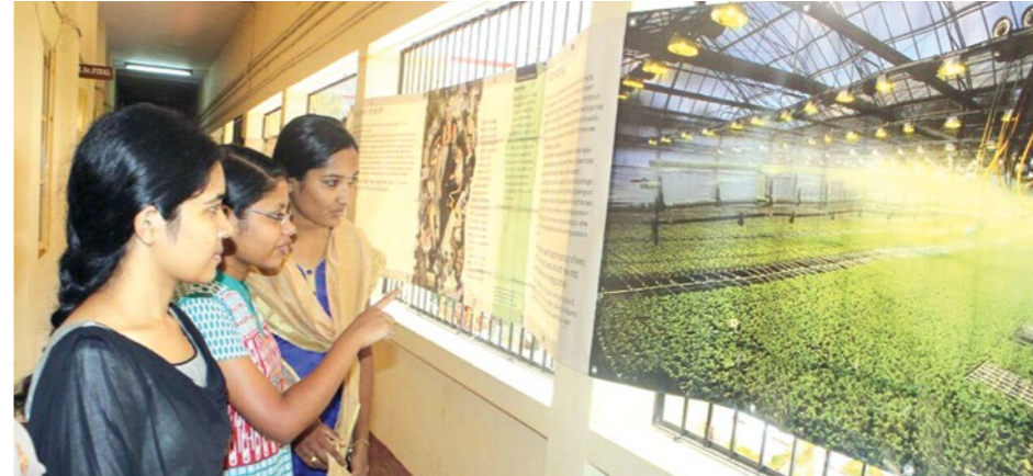
65 METER LONG BANNER DISPLAYED AT THE DEPARTMENT OF BOTANY

The WHOLE EARTH? Exhibition, which is a 65 meter long banner comprising an evocative sequence of images knit around the themes of sustainability, equity and environmental ethics, was displayed at the Department of Botany from March 29 to April 2. 'WHOLE EARTH?' is based on the premise that students and universities can help