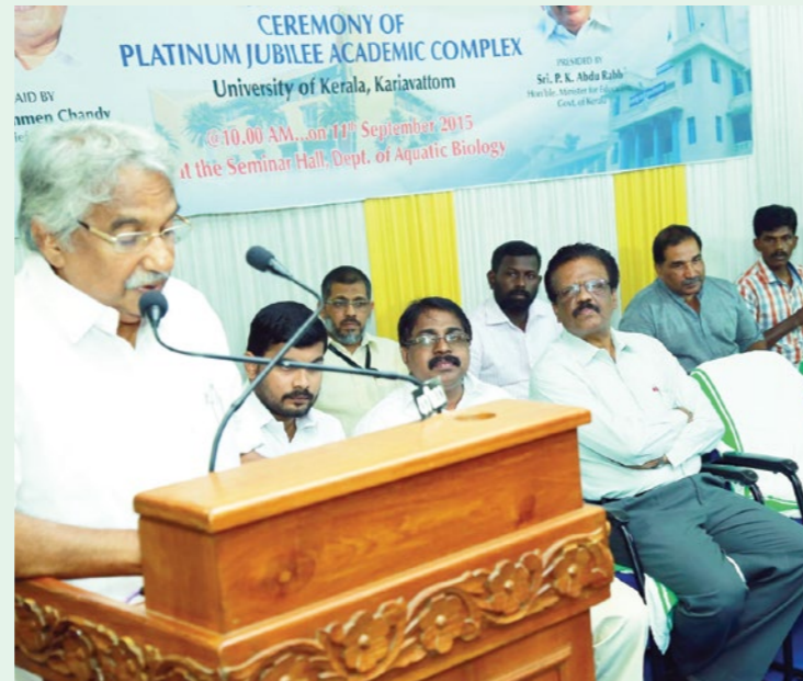
CHIEF MINISTER SHRI. OOMMEN CHANDY DELIVERING THE INAUGURAL ADDRESS