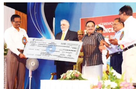
CHANCELLOR JUSTICE P SATHASIVAM PRESENTING THE CHEQUE

He stressed the urgent need for all the stakeholders to work together, resolving the differences through wholesome de-