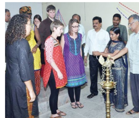
STUDENTS FROM THE UNITED STATES AT THE UNIVERSITY AS PART OF SIP

Six students from various universities of the United States enrolled for the second leg of Semester in India (SIP) programme in January. The programme was developed jointly by the International Institute for Scientific and Academic Collaboration (IISAC) and the University of Kerala in 2014. The Semester in India programme offers a rare opportunity to learn about the country through classroom work, field trips, directed research and social interactions. The programme intends to promote cultural understanding, international education, faculty-led programmes, experiential learning, youth enrichment activities and international research for moulding a generation of students who will be successful in today's global society.