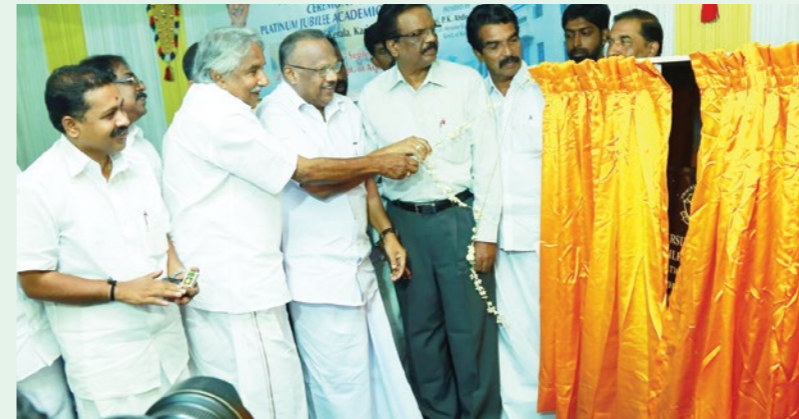
CHIEF MINISTER SHRI. OOMMEN CHANDY UNVEILING THE PLAQUE

The Internal Quality Assurance Cell of the University completed a year of activities in the third cycle, marked by comprehensive documentation and major initiatives. Compilation of a Master Action Plan on Quality, 60-month Planner, Library Quality Audit, Environmental Audit, Holding of 3-tier Induction Programme, Multi-disciplinary Annual Research Conference (MARC), launching projects such as eBook series, 1000 Wikilights project, Academic Audit, Bench Mark Series, Annual Student Survey, Graduate Attributes Video, PG Brochure publication etc have been the major activities of the IQAC in 2015. A newsletter of the IQAC is also released. The Cell held eight meetings during 2015 and also prepared the AQAR and submitted it to the Syndicate.