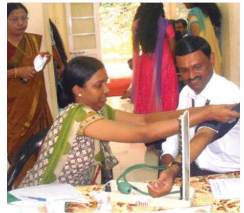
A MEDICAL CAMP BEING CONDUCTED FOR THE STAFF & STUDENTS OF THE KARIAVATTOM CAMPUS WITH THE SUPPORT OF CSI MEDICAL COLLEGE, KARAKONAM ON DECEMBER 13