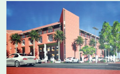
THE PROPOSED PLATINUM JUBILEE ACADEMIC COMPLEX

Chief Minister Shri. Oommen Chandy laid the foundation stone for the proposed Platinum Jubilee Academic Complex at Kariavattom on September 11, 2015. The work of the first phase is in progress. This academic complex, with an area of 50,000 square metres spread over four floors, has been envisaged to suit the needs of the school system, with all the departments of different Schools brought under one roof. This has to be completed in nine phases using the State Plan Funds. The proposed complex will further augment the quality of educational facilities offered in the campus