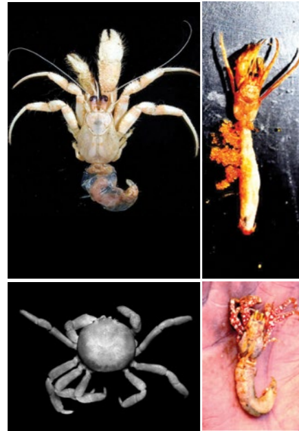
DISCOVERED CRAB SPECIES