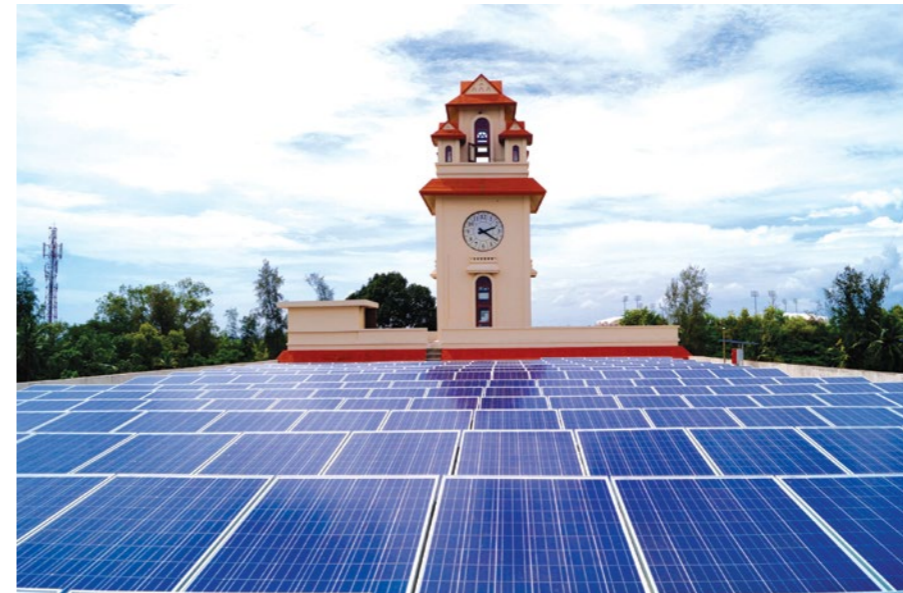
SOLAR GRIDS DISPLAYED ON THE ROOF OF THE GOLDEN JUBILEE BUILDING