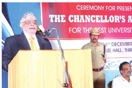
CHANCELLOR JUSTICE P SATHASIVAM ADDRESSING THE GATHERING