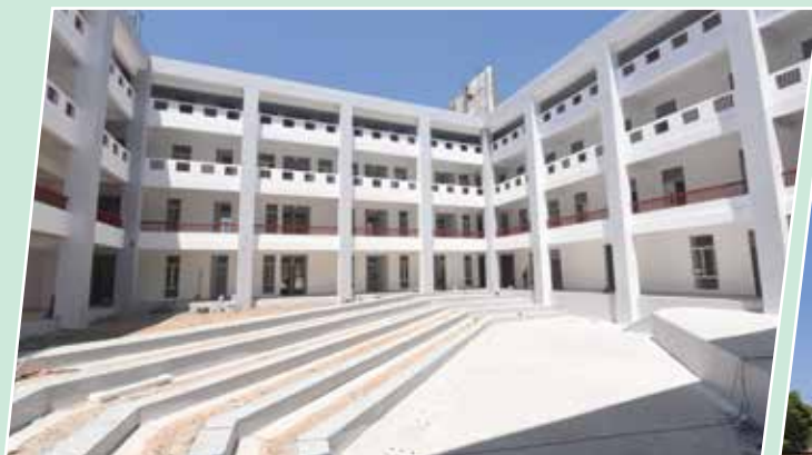
ONV Memorial Building