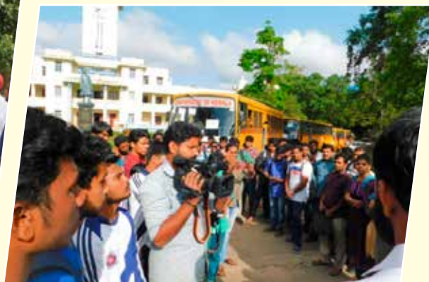
Relief and rehabilitation programme by NSS on 22 & 23 August 2018 during the Massive Flood