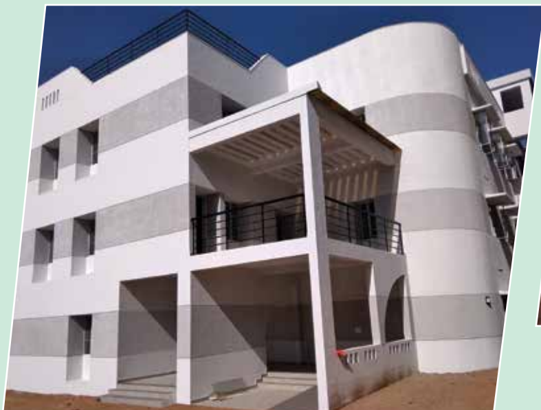
Controller of Examinations – Annexe Building