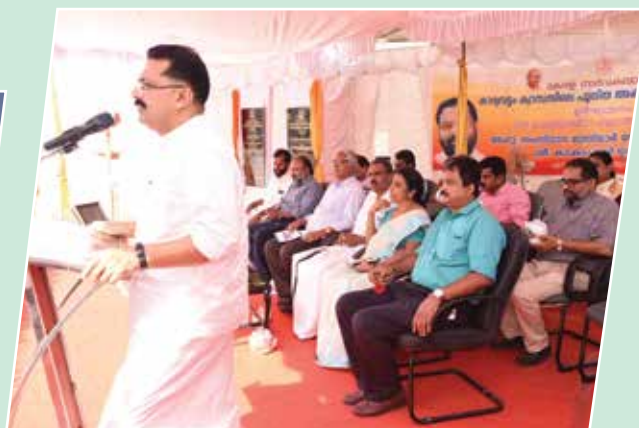
Dr. K. T. Jaleel , Hon'ble Minister for Higher Education, Minority Welfare, Hajj and Wakf inaugurated ONV Memorial Building and CLIF Building at Kariavattom campus on 27.02.2019