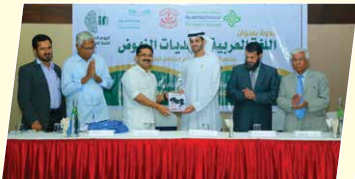
Department of Arabic in collaboration with King Abdul Azeez Centre for Arabic Language, Riyadh celebrated 'International Arabic Day' on 18th December 2018 at Hotel Appollo Dimoro, Thiruvananthapuram . The event was inaugurated by Dr. K. T. Jaleel, Hon'ble Minister for Higher Education, Minority Welfare, Hajj and Wakf